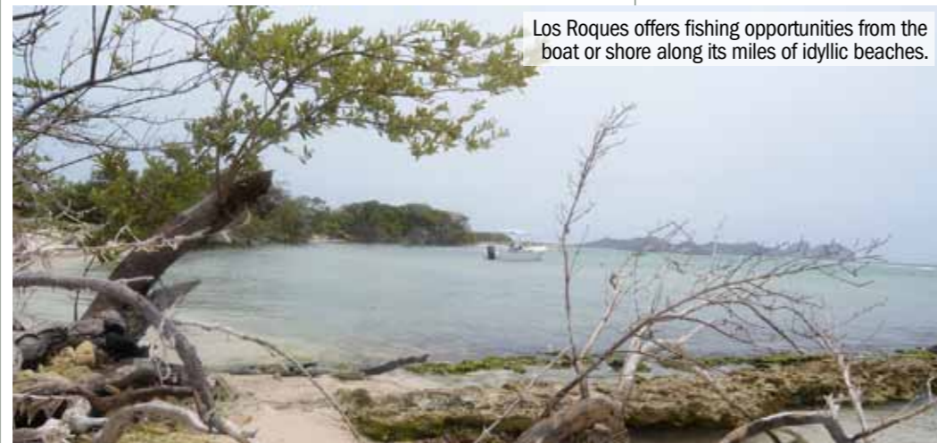
Los Roques offers fishing opportunities from the boat or shore along its miles of idyllic beaches.

For those already familiar with bonefishing, the flies used on the flats are light shrimp patterns and small Gotcha, pretty much in line with Cuba and the Bahamas. However, the shorelines of all the Los Roques islands are literally crowded out with millions upon